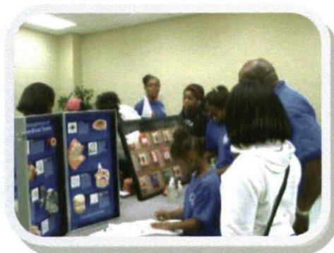
Back to school participants visit CoC display booth

Owens about how their lives or those of loved ones were negatively impacted by tobacco use. Many were able to discover possible life-saving information concerning this preventable killer.