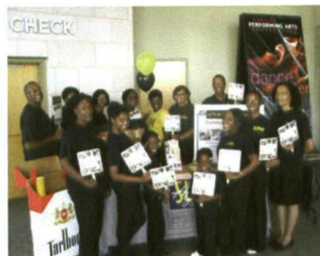
Xtreme Praise participants pose at CoC display booth

Following that activity, attendees were encouraged to view various visuals illustrating the effects and consequences of secondhand smoke exposure.