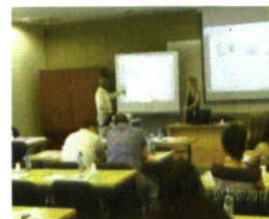
Chisley lectures trainees

In Armenia, farmers do not pool their resources to reduce cost but generally work individually because of past conditions under Russia. Also, there is a general lack of trust among cooperative members; therefore farmers have difficulty paying dues to the cooperatives. And they do not use extension programs to assist farmers at the local level.