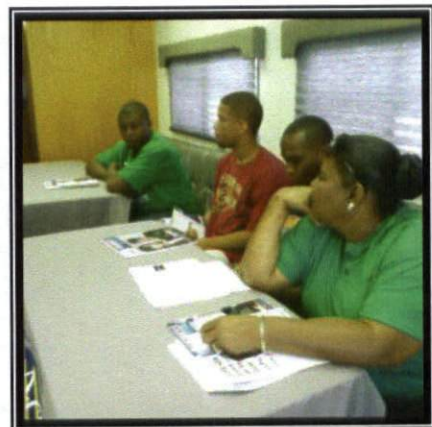
Participants inside the Mobile Training Center at "Back to School" event