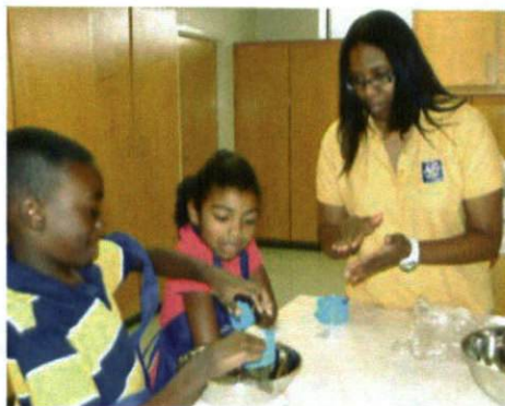
Students learn how to measure ingredients

There were 17 participants in the first group and 12 in the second.