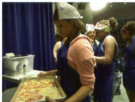
Participants prepare pizza for the oven