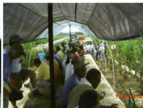
Participants on a hayride tour of field plots