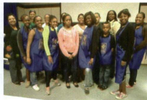
Teacher/student team pose, bid farewell