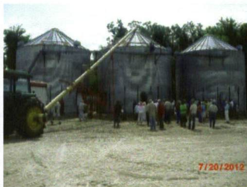
Loading corn into the grain silos

Both Armstrong and Down jointly own three steel grains silos with a capacity of 15,000 bushels each. They are also constructing three new similar silos, each costing about $75,000.