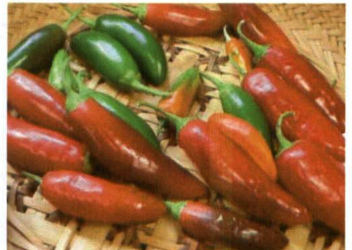
Peppers from the summer garden